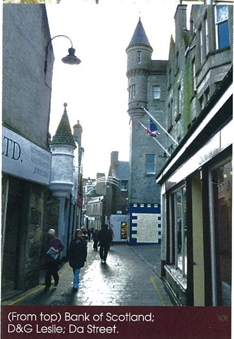
(From top) Bank of Scotland; D&G Leslie; Da Street.