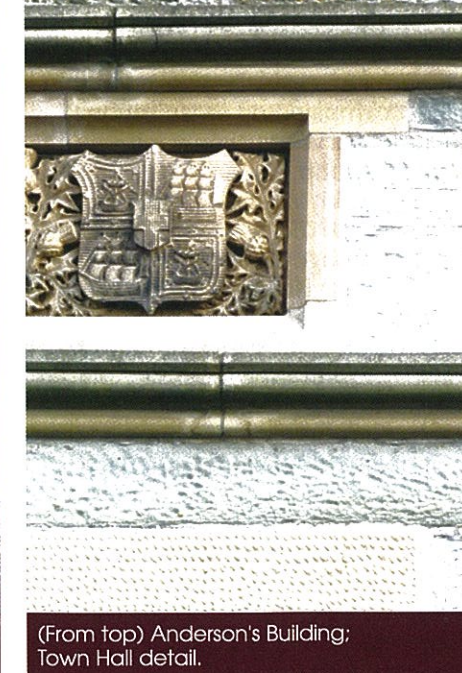
(From top) Anderson's Building; Town Hall detail.

looking up if you are an architect. The world famous architect and genius Antonio Gaudi, famed for his fantastic buildings in Barcelona, was working on the construction of his masterpiece, the cathedral of Sagrada Familia. To get a better view of his extraordinary creation he looked up and stepped back to study his work, and was promptly run over by a tram.